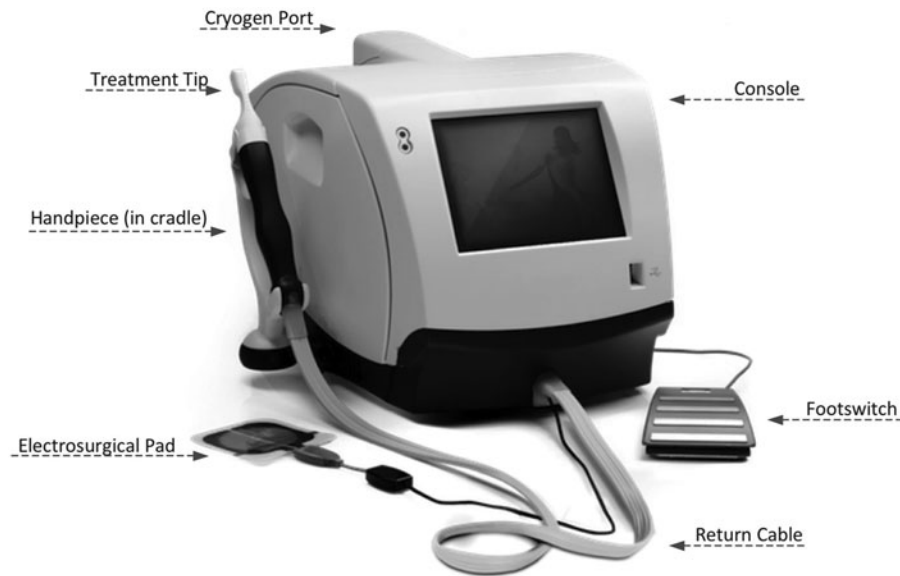
FIG. 1. The in-office procedure, table top radiofrequency (RF) system comprising a RF console with an integrated cooling module, a horizontal handpiece, and disposable, single-use treatment tip.

nonablative approach to creating heat within the submucosal layer of vaginal tissue while keeping the surface cooled. The system consists of a RF console, a cooling module, a horizontal handpiece, and a treatment tip (Fig. 1). It uses reverse thermal gradient RF technology. The monopolar RF pulse is generated to selectively heat a given volume of tissue beneath the surface, while the integrated cryogen is delivered to the inside of the treatment tip to cool and protect the surface tissue—the vaginal mucosa. RF energy pulses delivered at each dose are electronically monitored by the system to operate within the specifications for the RF device within the expected range of total pulses. Each of the three obstetricians/gynecologists operators who performed the procedures was trained by a board-certified U.S. gynecologist who had been involved in the prior U.S. study. They received on-site didactic learning and supervision. The procedure was standardized and performed in the same manner by the HCPs.